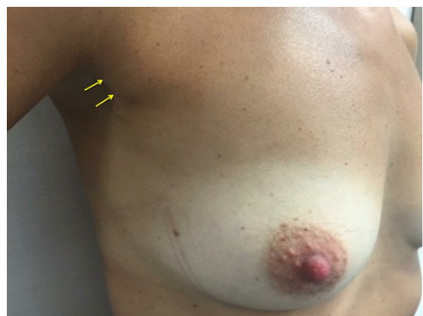
Figure 1 – On examination a small fixed palpable lump was detected on the right anterior axillary line near the axilla (arrows). The adjacent skin surface had no change.

On physical examination, a small fixed and painless palpable lump was detected on her right anterior axillary line near the axilla (Fig. 1). There were no changes in the adjacent skin surface and absence of nipple or areolar complex. No palpable