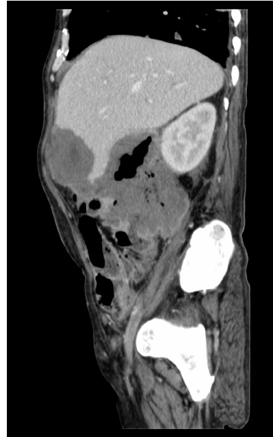
Figure 4 – Contrast enhanced Computed Tomography sagittal image showing a heterogeneous multiloculated collection, due to the presence of fecal material, air and fluid.