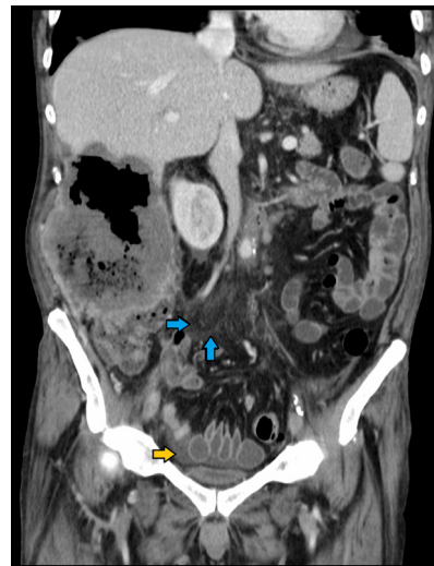
Figure 5 – Contrast enhanced Computed Tomography coronal image showing fat stranding (blue arrows) adjacent to the collection and free peritoneal fluid (yellow arrow).