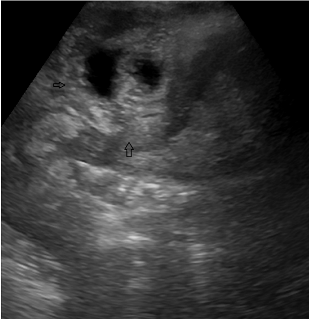
Figure 2 – Ultrasound image showing a heterogeneous mass (arrows) between the hepatic parenchyma and colonic loops.

performed. The CT showed a collection with multiloculated and heterogeneous appearance located in the hepatic parenchyma with a sinus tract to the adjacent loop of the ascending colon. It also showed stranding of the pericolic fat and free peritoneal fluid. (Figs. 3, 4, 5).