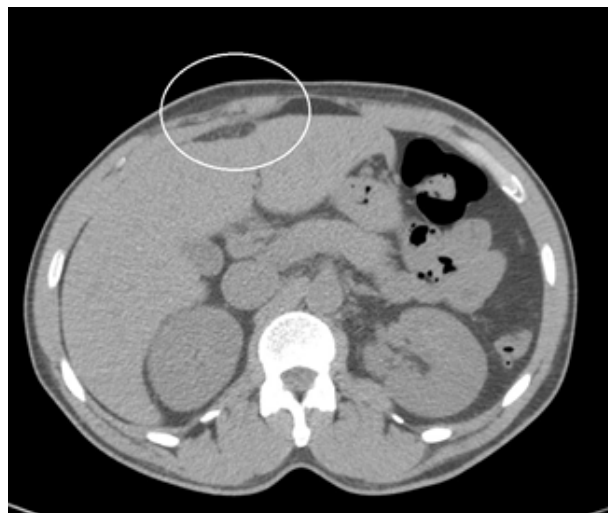
Figure 1 – Axial CT image showing fat stranding in a lipomatous appendage of the falciform ligament compatible with infarction. The surrounding inflammatory changes in the adjacent fat and myofascial planes give rise to a subtle focal cutaneous lump, evident if we compare it with the contralateral side.

The pathophysiology of this condition is similar to the more commonly seen omental infarction and epiploic appendagitis, encompassing the spectrum of intra-abdominal focal fat infarction (IFFI) that has recently been described. 2,4