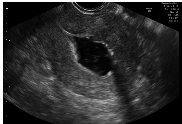
Fig. 3 - Empty uterine cavity, confirmed by hysterosonography, after successful resectoscopic resection of the submucous uterine myoma (Voluson E8 system (GE Healthcare, Zipf, Austria))