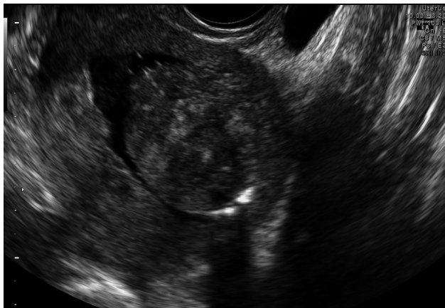
Fig. 1 - 2D hysterosonography of the submucous myoma (Voluson E8 system (GE Healthcare, Zipf, Austria))

A transvaginal ultrasound scan/hysterosonography was performed after her first pos-operative menstrual period, which occurred immediately after the suspension of the combined oral estroprogestative therapy. There were no abnormal findings during the imaging examination, confirming the surgery success in the complete removal of submucous myoma - see figure 3.