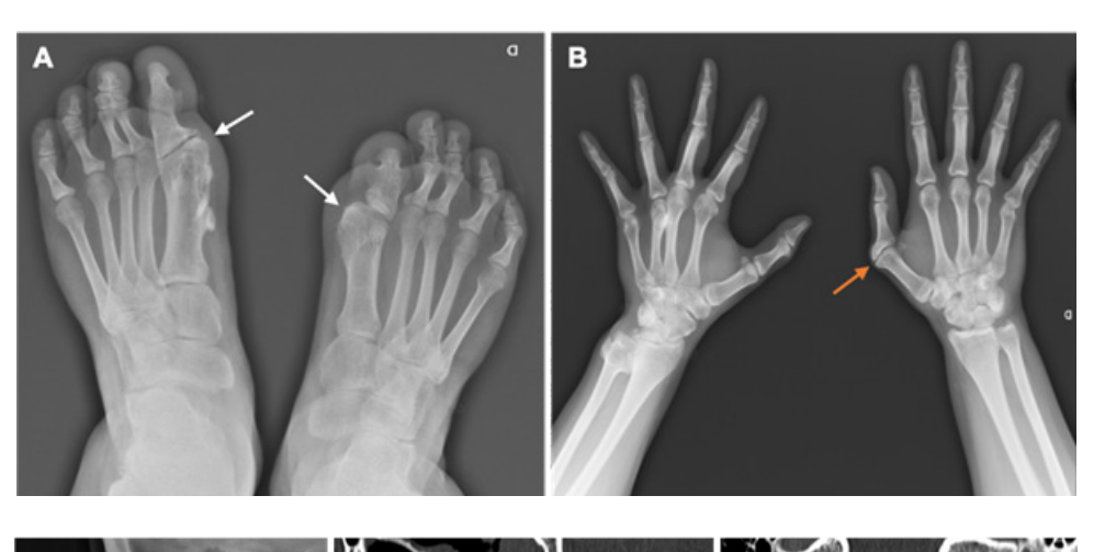
Fig. 2 - Radiograph of the feet (A) depicts bilateral great toe deformities, including shortening and distal medial protuberance of the first metatarsal (white arrows), and segmentation anomaly/ synostosis of the interphalangeal joint, resulting in monophalangism. Radiograph of the hands (B) also shows a similar malformation of the right thumb (arrow), with clinodactvly and distal medial protuberance of the first metacarpal and proximal phalanx. A dysmorphic distal left ulna is also present.

The most characteristic feature of this disease is HO of the soft tissues that ultimately leads to extra-articular ankyloses. These ossifications have a characteristic anatomical and temporal pattern of progression: axial to appendicular; cranial to caudal; proximal do distal; dorsal to ventral. Typically, the disease progression is episodic, often