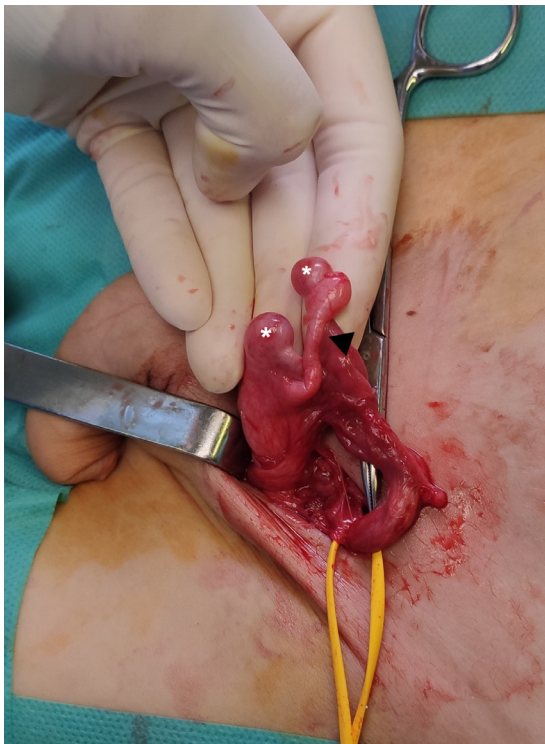
Figure 2 – Intraoperative photograph showing scrotal content delivered through the inguinal incision: two testes (asterisks) connected to the same epididymis (arrowhead) and draining into a common vas deferens.