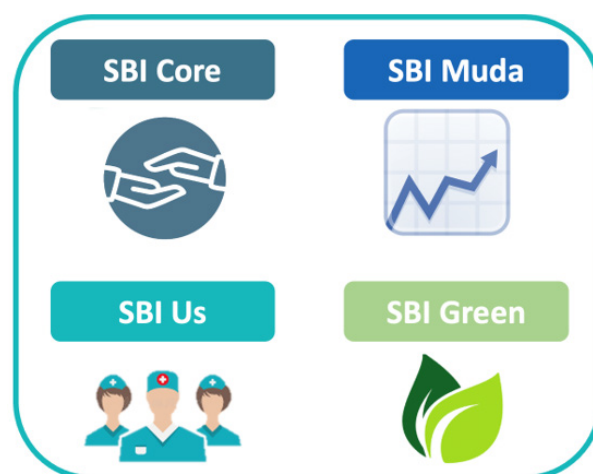
Figure 1. Four Focus areas of the Safe Brain Initiative

Autor Correspondente/Corresponding Author: