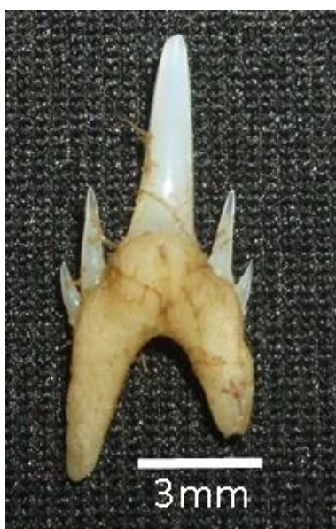
Fig. 2. Lateral view of the tooth, following removal from the acoustic receiver housing.

Examination of the embedded tooth found it to be single-cusped, labio-lingually flattened and having smooth cutting edges. Crucially to species identification were two pairs of prominent lateral cusplets adjacent to the basal edge of the crown (Figure 2). Using these diagnostic features, the tooth was unambiguously identified to the smalltooth sandtiger, Odontaspis ferox (FAO, 2002). The tooth had an overall length of 12.60 mm, enamel height of 5.25 mm, maximum width of 5.15 mm and maximum lateral cusplet length of 2.98 mm. Further information on shark size, jaw position or orientation was not available from the single tooth specimen.