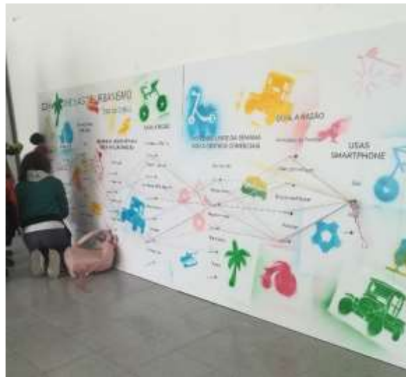
Figure 3. Students interacting with a structure available in the school lobby prior to the labs to collect ideas from the broader school community

transforming learning into a more organic process. This is relevant, as the recent education legislation in Portugal requires more curricular flexibility and considering the particularities of the community (Decree-Law 54/2018). Teenagers also benefit from a better urban education or territorial capacity building as “a way of giving people some certainty and of embodying knowledge rooted in their spaces, the ones they create and know at the same time that they create themselves, as individuals and citizens” (Estrela & Smaniotto, 2019: 48). To build more inclusive, safe, resilient, and sustainable cities, policy makers must commit to building teenagers’ capacity and overcome stereotypes.