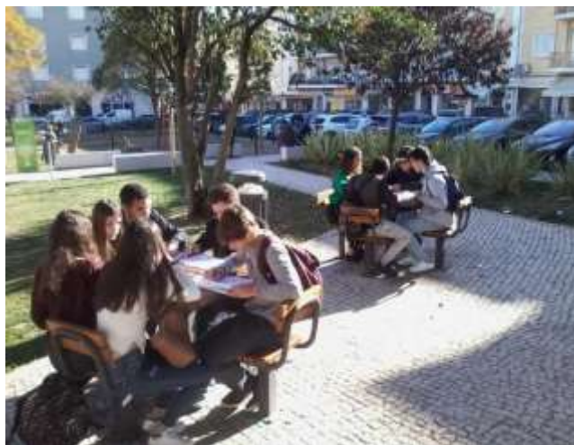
Figure 1. Students were taken to a discovery trip through public spaces in Alvalade

Note: Here they are discussing and analysing their field notes.