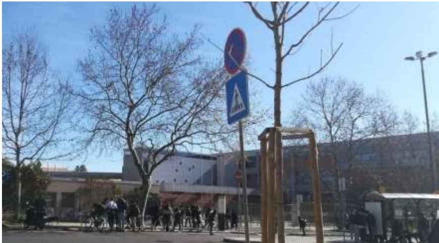
Figure 2. Students hanging out in the bus shelter and leaning on the sharing-bike station