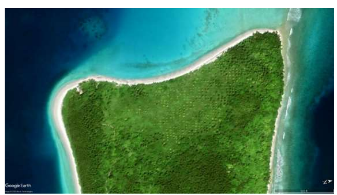
Figure 3. The gridded fields of coconut palms stand out from lower hardwood populations at Barton Point, Diego Garcia (2016)