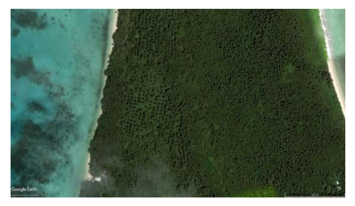
Figure 2. The gridded fields of coconut palms north to East Point, Diego Garcia (2016)

experienced and trained workforce is selected given the physical exertion necessary to work in rough seas with strong currents, coupled with inclement wet or hot weather (Carr, 2010, p. 15).