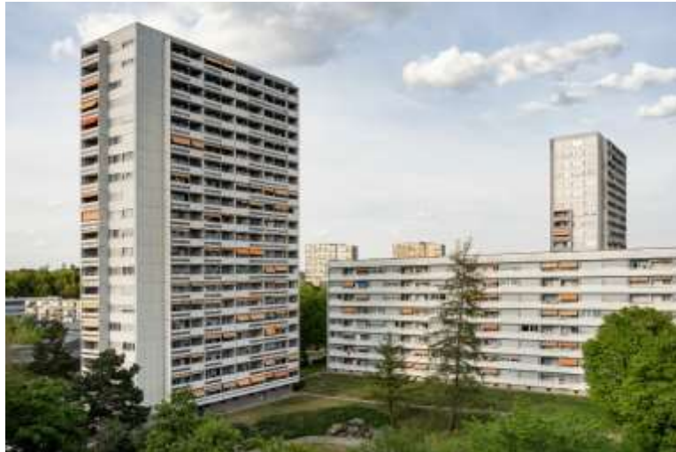
Figure 2. Tscharnergut comprises a mixture of high-rise buildings and slab houses with large green areas in between