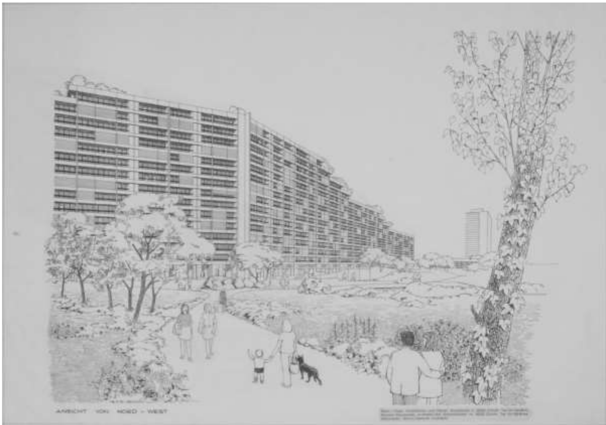
Figure 6. Original drawings of Telli show how the architects envisioned people in the housing estate

Source: © Marti & Kast Architekten und Planer, gta Archiv, ETH Zürich.