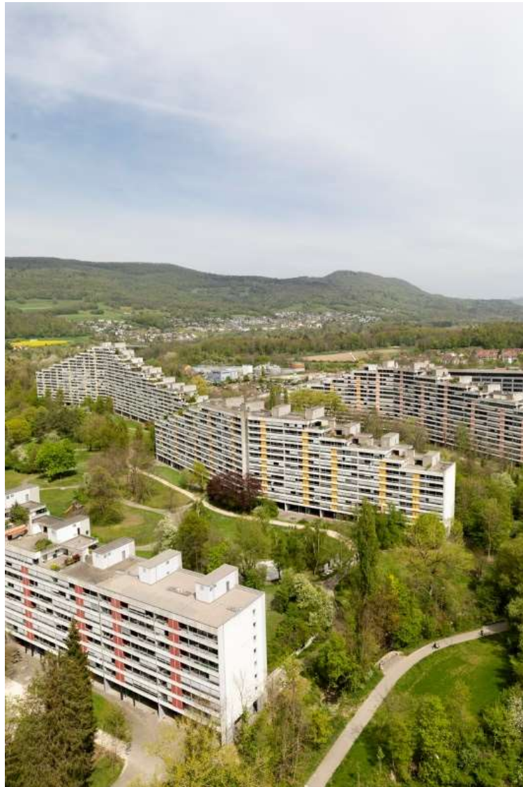
Figure 4. Telli consists of four extended high-rise blocks in green surroundings