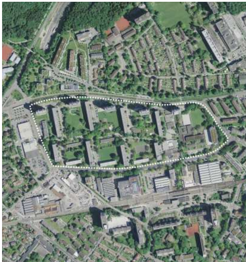
Figure 1. Aerial photo of the Tscharnergut estate 1:1000

Tscharnergut's urban design is clearly structured with five high-rise buildings, eight slab-type houses and two rows of single-family houses. This mixed construction method, with the alternation of high and low, large and small buildings, was intended to prevent a "monotonous" appearance and, additionally, create large and clearly structured exterior spaces between the residential buildings. The team of architects behind the planning of Tscharnergut had a concept that was unusual in Bern at the time: a dense overall neighbourhood development with a strong social imprint and a community-promoting structure (Steiger, 1963, pp. 7–9). For this, a variety of facilities and collective spaces for playing, meeting, sports and leisure activities have been included in the estate, together also with a little shopping centre, a prominent neighbourhood square and a restaurant. The community centre which was planned with the estate, is the first of its kind in Switzerland and played a pioneering role for the formation of future community centres, not only in Bern but also other places in Switzerland, such as Telli in Aarau.