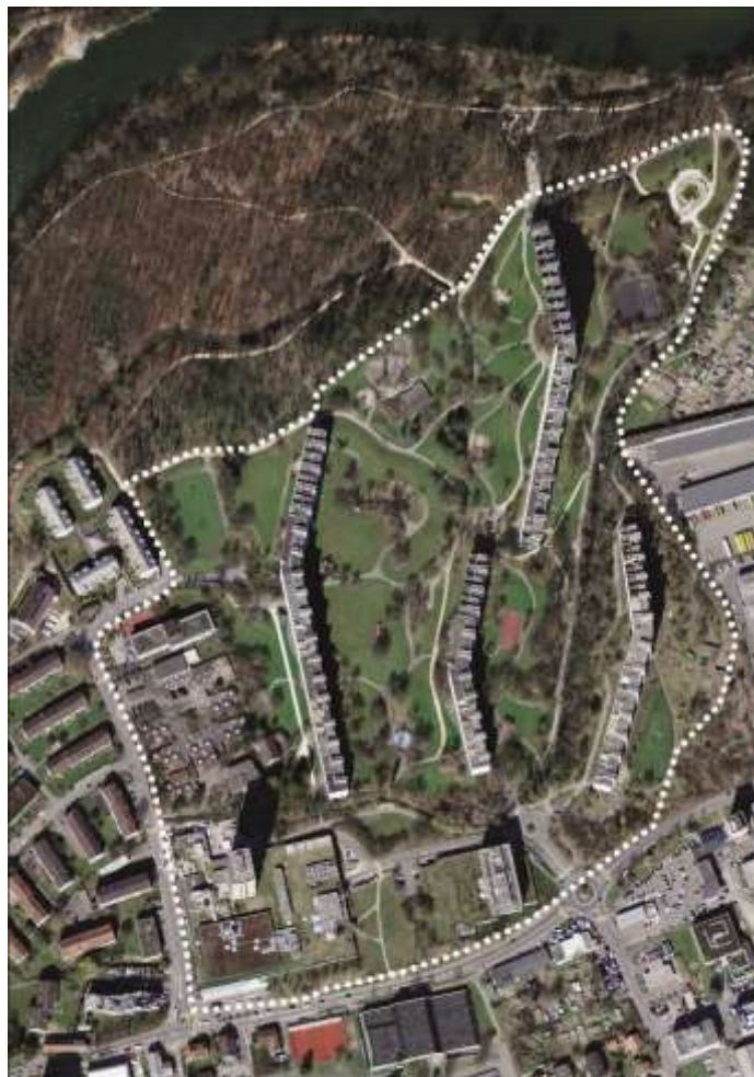
Figure 3. Aerial photo of the Telli housing estate 1:1000