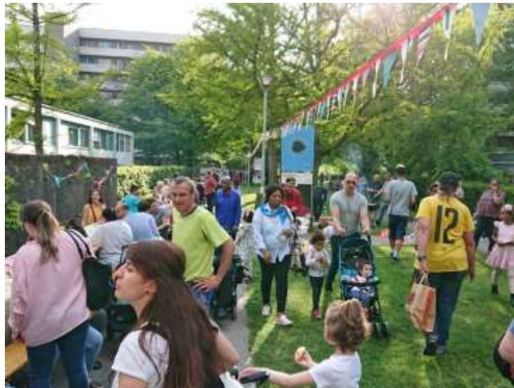
Figure 9. Neighbourhood party 2019, one of many events initiated by the community centre

At the same time, initiatives of mutual support among neighbours emerged during the crisis. In Telli and Tscharnergut, the already existing longstanding neighbourhood networks and especially the activities of community work have turned out to be key in organising and coordinating neighbourhood help during the pandemic lockdowns, and have provided shopping assistance and home meal delivery services by younger adults for older residents. The trust that has been built up over many years, and the fact that there is a reliable contact point in the neighbourhood with key people who residents know personally, was decisive in ensuring that this offer was also actively used by many older adults. The Tscharnergut's coordination hub for neighbourhood help has also been profiled in newspapers as exemplary, especially because of its accessibility for risk groups who are not digitally savvy, providing the option of analogue access to help via a phone number and on-site presence (e.g. Streit, 2020).