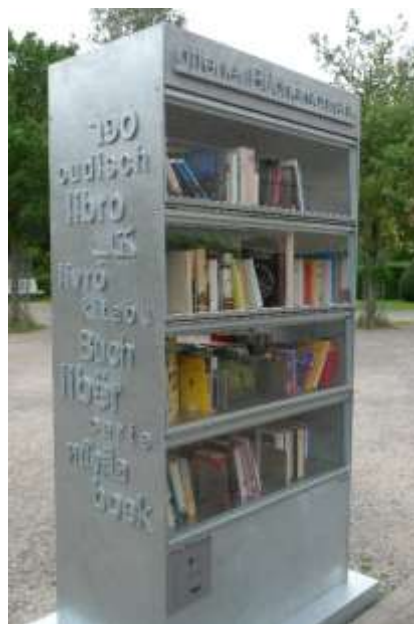
Figure 8. The open bookcase installed by the community centre in Telli offers titles in many different languages and is a gathering place in the neighbourhood