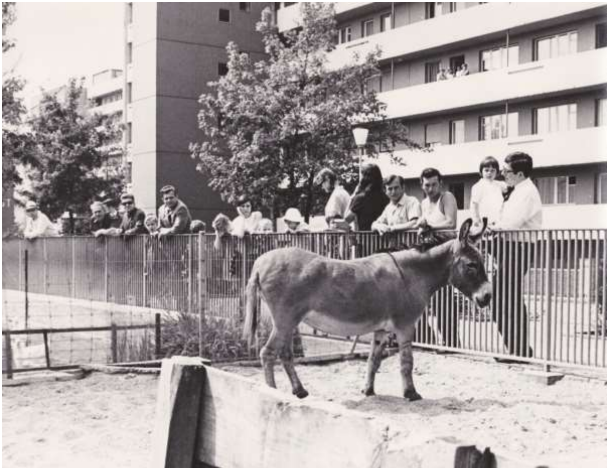
Figure 5. Petting zoo in Tscharnergut, an example of the variety of collective spaces integrated into the housing estates