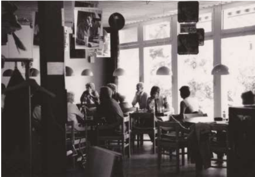
Figure 7. The community centre in Tscharnergut has been key in promoting social encounters since the very beginning

interviews with residents in both estates. For some, the community structures are more important, which is especially the case for older people and families, which are also the main target groups of the centres (see chapter 4). For others however – especially for working persons without children and for younger adults – the community centres are often quite far away from their everyday realities and many of them never or hardly ever visit them. Neither in Telli nor in Tscharnergut did anyone question their raison d'être during the interviews.