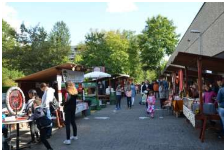
Figure 10. Annual market day in Telli organised by the community centre