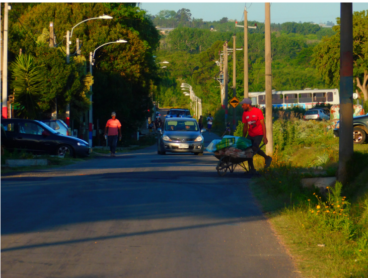
Figure 21. Paved road on Nuevo España, Montevideo, Uruguay

Local residents in Zurich mobilised to design and build the Kalkbreite housing cooperative. Designed and managed in a participatory way, the ARPA project offers communal living spaces open to everyone in the city, multiple shared spaces for cooperative residents, including kitchens, and conscious efforts to limit their impact on the environment. In addition to focusing on environmental sustainability and resource circularity, the cooperative provides venues for the surrounding community and preserves the already existing Zurich tram depot beneath.