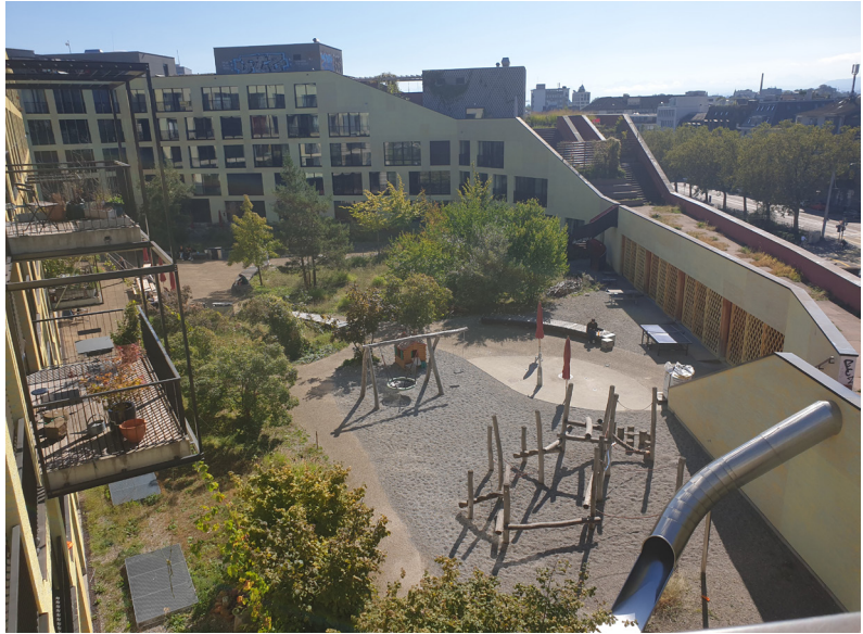
Figure 20. Kalkbreite, Zurich, Switzerland