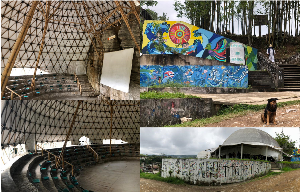
Figure 8. Tosepan, Cuetzalan, Puebla, Mexico