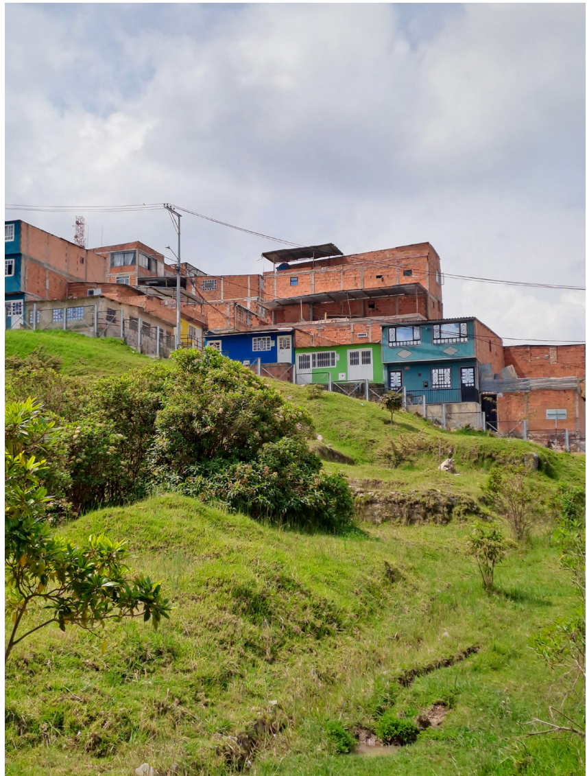
Figure 17. After the Landslide - Hills and housing, Altos de la Estancia, Bogota, Colombia

A green open space surrounded by a vibrant legalised neighborhood. Thousands of informal shelters housing hundreds of families were relocated due to (high risks of) landslides. Since then, nature is slowly growing back, concealing the contestations over the place. The bushes and green pastures serve as memories of a once rural place, and the community gardens nearby remind us of the daily labour and commitment to feed the bodies and souls of residents.