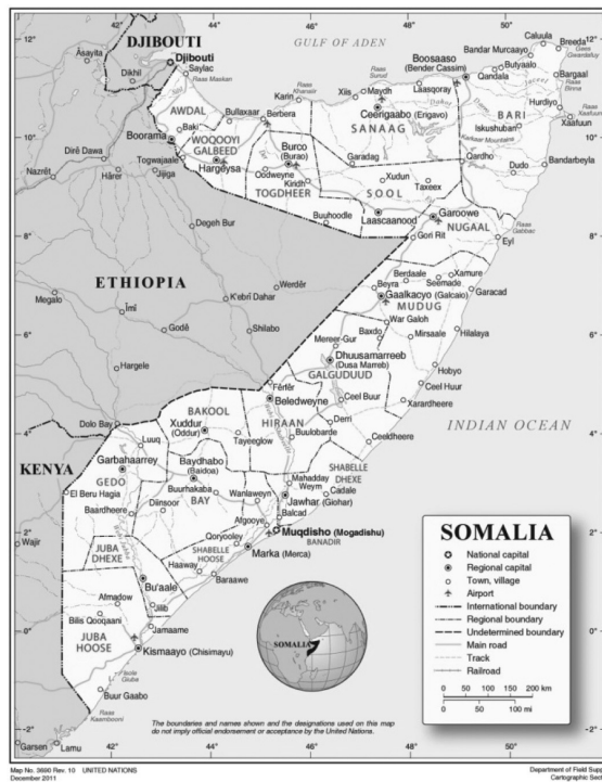
Map 1: Somalia

In 1991 the regime of Mohamed Siad Barre was overthrown, ending a 22-year military dictatorship. Since this date, central and south Somalia have been in a civil war with the absence of a functioning central government. The country has also been the target of several external interventions 5 .