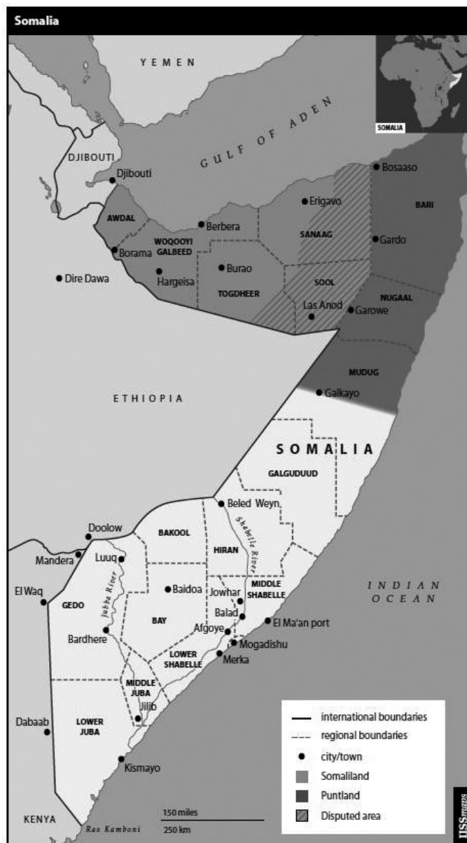
Map 2: Political map of Somalia

ment rate of the AMISOM troops from US$550 to US$1028 per soldier per month, which significantly renewed the interest of countries contributing to the mission (Williams, 2009). Over the next years the deployment of troops would increase significantly, reaching 11,000 troops by 2011 and a full revised strength of 17,000 by 2012 (IPSS, 2012).