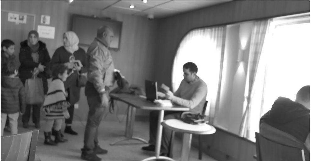
Figure 3 – Across the straight.