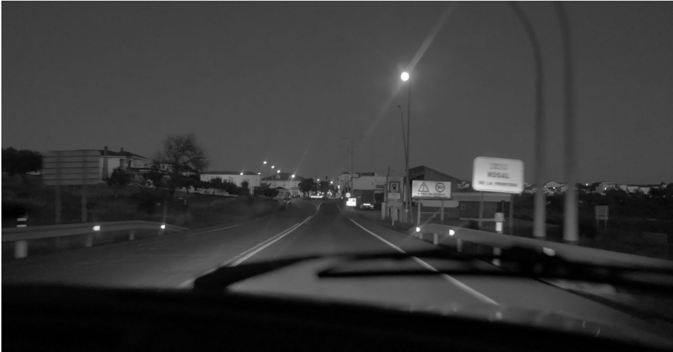
Figure 2 – Border lexicon.