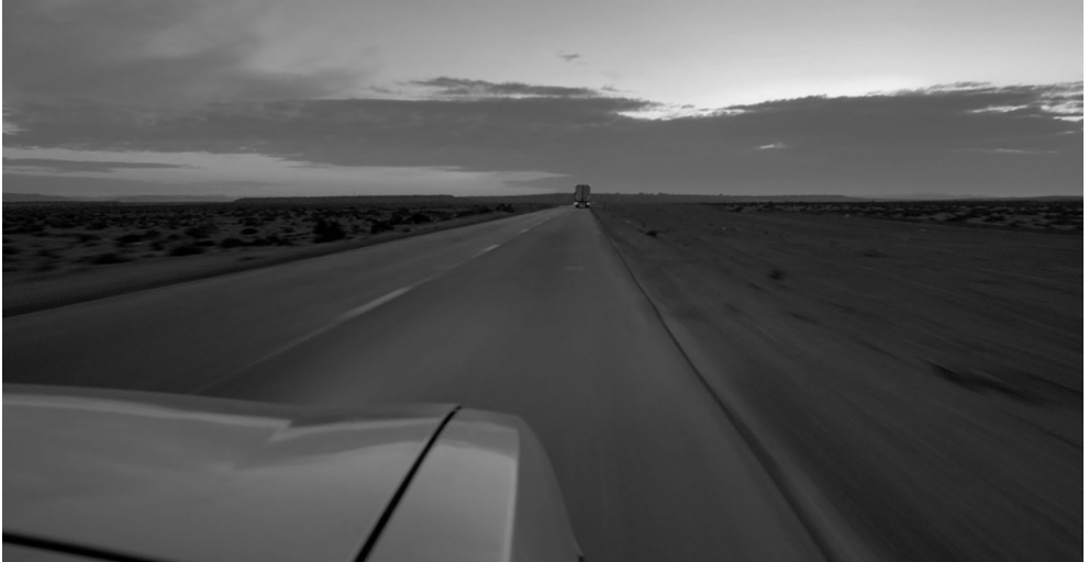
Figure 5 – Invisible lines.