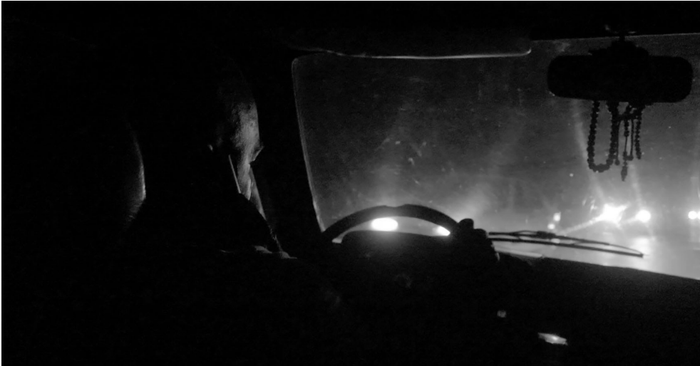
Figure 10 – The border within.