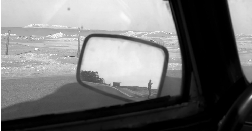
Figure 8 – Travelling border.