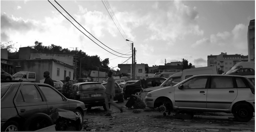
Figure 1 – A Senegalese enclave.