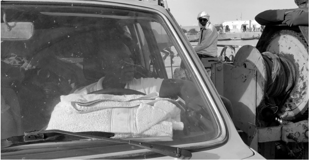
Figure 9 – Border twins.