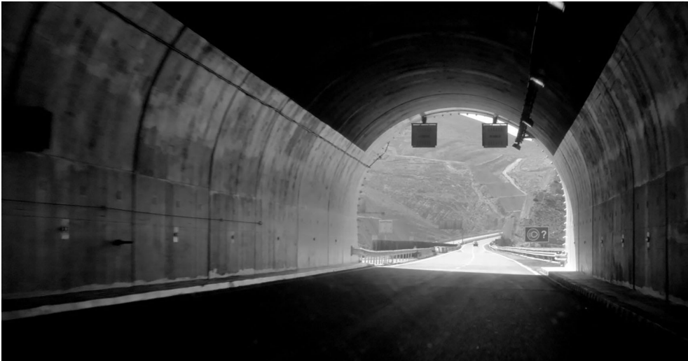
Figure 4 – Mnemonic border.