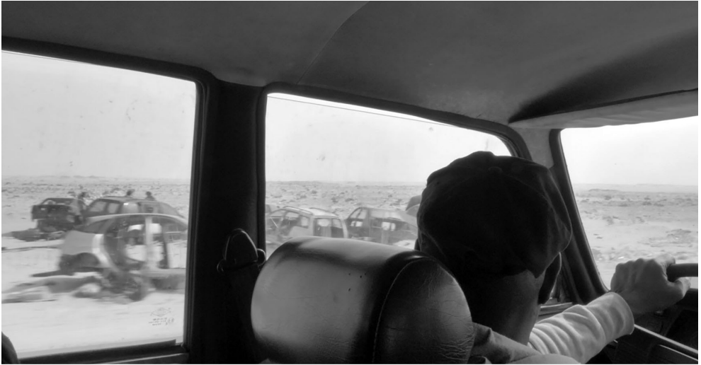
Figure 7 – “Kandahar”.