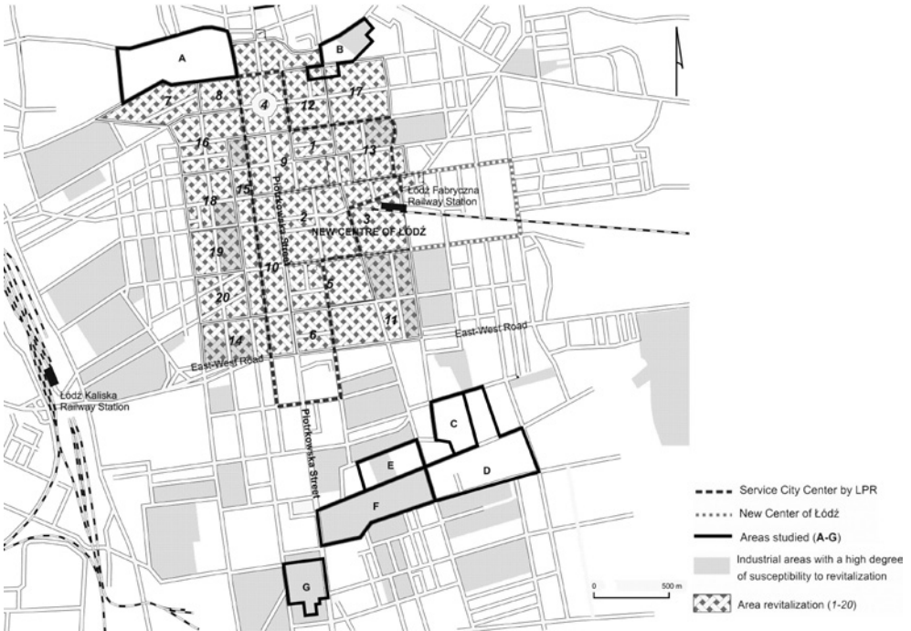
Fig. 3 – Study areas in the context of urban regeneration programs in the downtown of Łódź. Fig. 3 – Áreas de estudo no contexto de programas de regeneração urbana no centro da cidade de Lodz.