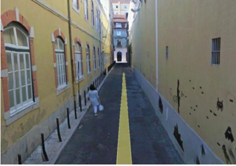
Fig. 1 – Unsuitable sidewalk. Fig. 1 – Passeio impraticável.

Parks and open spaces: In a similar way, we opt to represent parks and open spaces with their boundaries and a set of connectors between possible access points. Some parks do have formal paths and may require a more detailed representation.