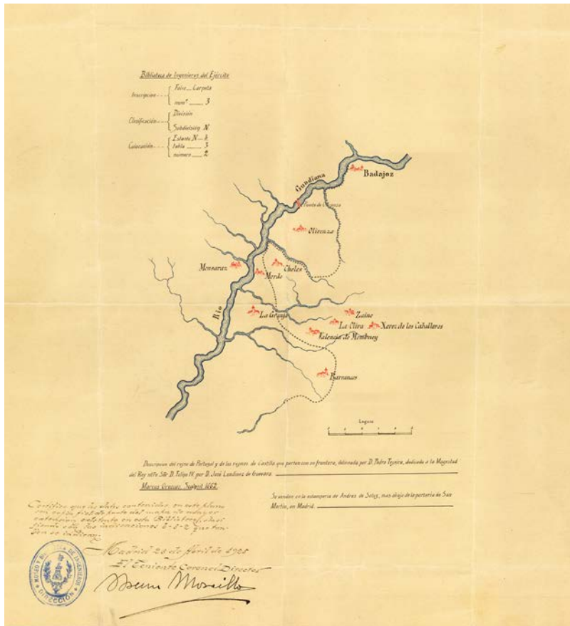
Fig. 1 – Limit between Castile and Portugal in Olivenza in 1662.

The border created with the Treaty of Alcañices gradually became, first, an area of expansion and, later, the line demarcating Castile and Portugal (fig. 1; Ladero Quesada, 1997). But how did a theoretical border – constituted by a treaty, and undefined, because it only listed villages, become a reality? Mainly because, after the signing of the Treaty of Alcañices, what exactly the agreement determined was specified and whether and how changes in the way the territory was used influenced the delineation of the border was taken into account (Herzog, 2015).