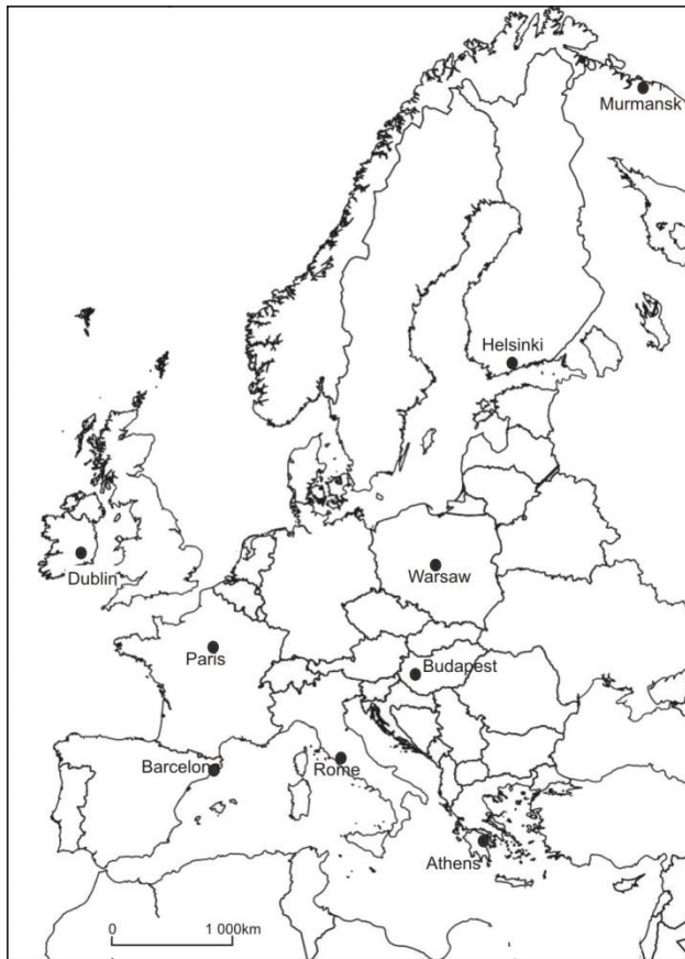
Fig. 2 – Meteorological stations used in this research.

vapour pressure, wind speed and total cloud cover for 12 UTC were used. The mid-day meteorological observations of air temperature, vapour pressure, wind speed and total cloud cover were used because of their representativeness to day-time period of the most intensive tourism outdoor activity. The data cover the period 1991-2000. The meteorological stations of Barcelona, Rome and Athens represent the Mediterranean region and the seven stations of Paris, Dublin, Budapest, Warsaw, Moscow, Helsinki and Murmansk represent parts of central and northern Europe (fig. 2) ii . Most of meteorological data used in the research were obtained from national meteorological services via European Commission PHEWE project. Only data for Moscow and Murmansk were obtained from Russian Meteorological Service. The partial indices were calculated with the use of BioKlima 2.6 software package ( http://www.igipz.pan.pl/Bioklima-zgik.html ).