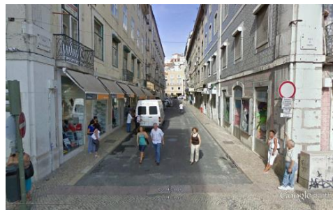
Fig. 4 – Pedestrianized street (traffic restriction). Fig. 4 – Rua pedonalizada por restrição de tráfego.