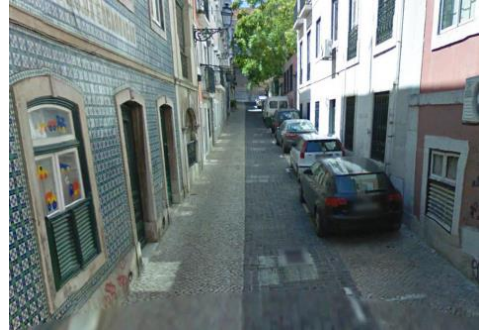
Fig. 2 – Paved street. Fig. 2 – Rua com pavimento em calçada.