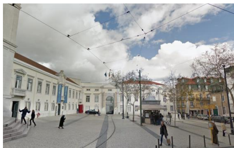
Fig. 6 – Local square/open space. Fig. 6 – Praça.

Colour figures (1 to 6) available online | Figuras a cores (1 a 6) disponíveis online.