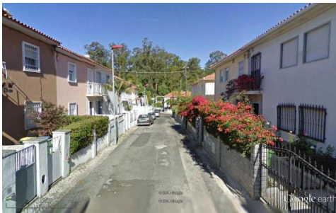
Fig. 5 – Local access street. Fig. 5 – Rua de acesso local.