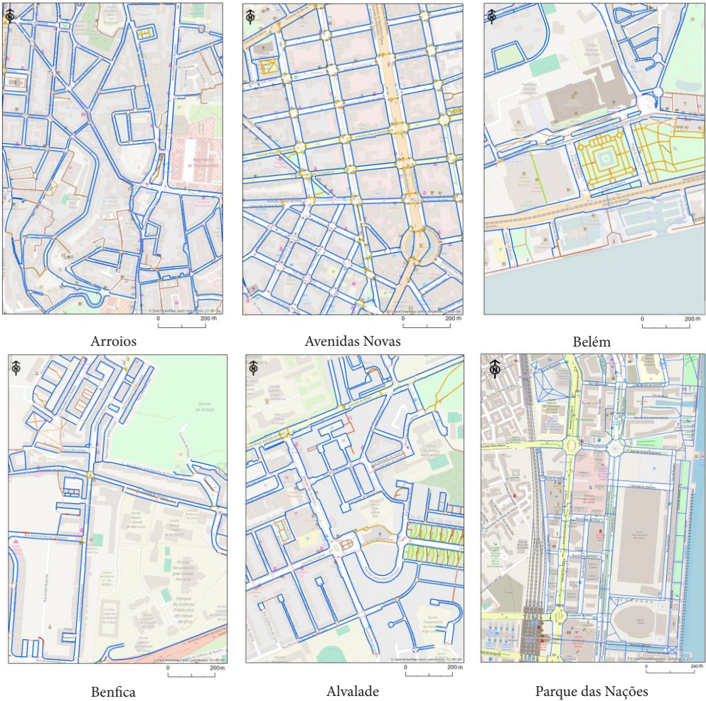
Fig. 8 – Street patterns of selected cases. Colour figure available online.