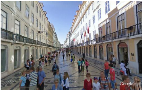
Fig. 3 – Pedestrian street. Fig. 3 – Rua pedonal.