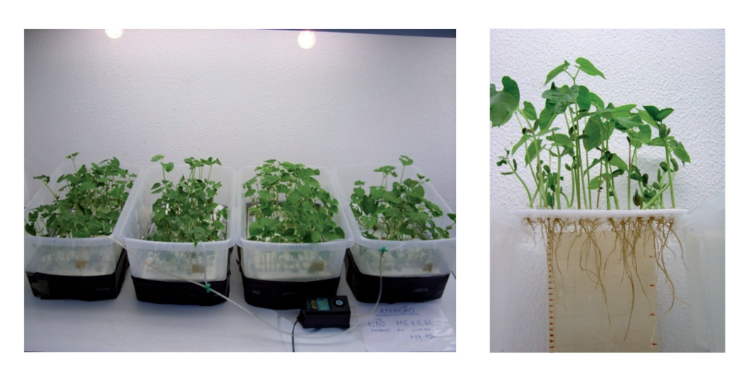
Figure 1 – Common bean plants were kept floating in recipients containing 15 L of nutrient solutions (left) and root elongation was measured after 72 hours treatment with O and 50 mM Al (right).

Fifteen traditional bean cultivars from Madeira clearly exhibited Al-tolerance with RRE72 above 50%. But only six accessions exhibited statistically superior Al-tolerance, with RRE72 above 64% (ISOPs 460, 463, 749, 773, 800 and 828). The majority of the accessions were classified as sensitive with RRE72 ranging from 25 to 50%. A great variability in the response to Al stress was observed among and inside the traditional cultivars, with the most resistant ISOP 800 having RRE72 of 74.15%, while the most sensitive ISOP 778 had merely 16.61% RRE72 (Table 1).