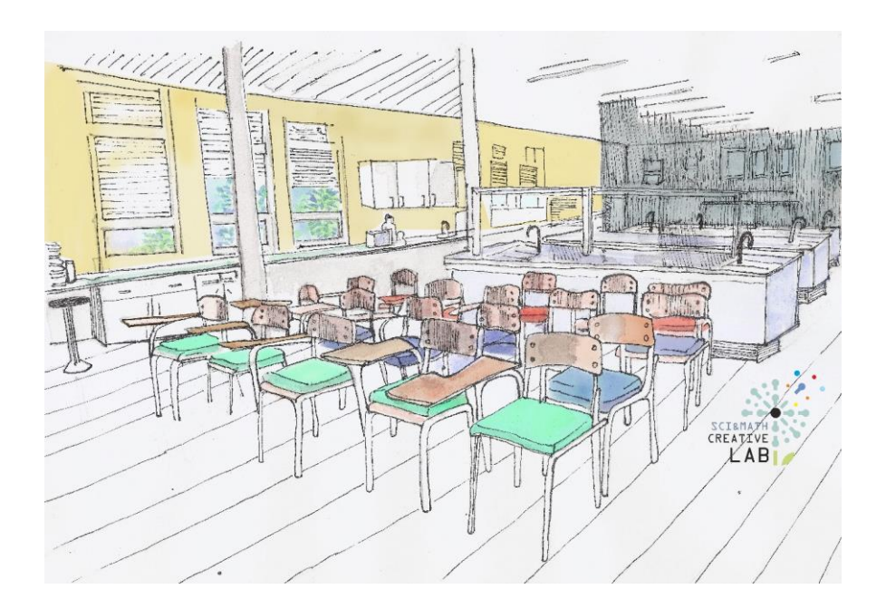
Figure 1 - Organization of CreativeLab_Sci&Math space.

In Figure 1, the area with the chairs is related to the Engage, Explain, Exchange and Empowerment moments. Behind the chairs, there are three areas where students can work in large groups and do, in group or individually, laboratorial activities or explore digital resources (Explore, Exchange, Evaluate). In the left side, there is an area where students can work alone or in small groups (Explore, Exchange, Evaluate).