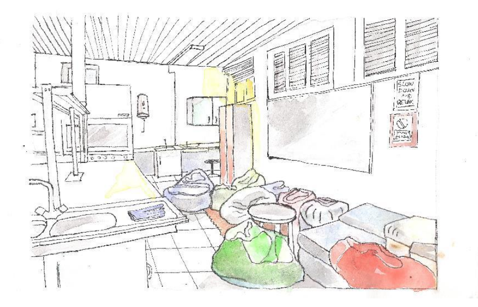
Figure 2 - Lounge area used to Exchange or Explore moments.

The CreativeLab_Sci&Math is equipped with different types of materials related to laboratorial activities of Biology, Geology, Physics, Chemistry and Mathematics. It is provided with wireless connection and digital resources.