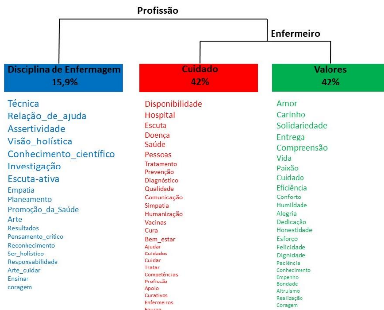
Figure 1 - Dendrogram of the students' DHC

The four quadrants graph (figure 2) of the students' discourse is presented, which contributes to the central nucleus, the first and the second periphery and the contrasting elements.