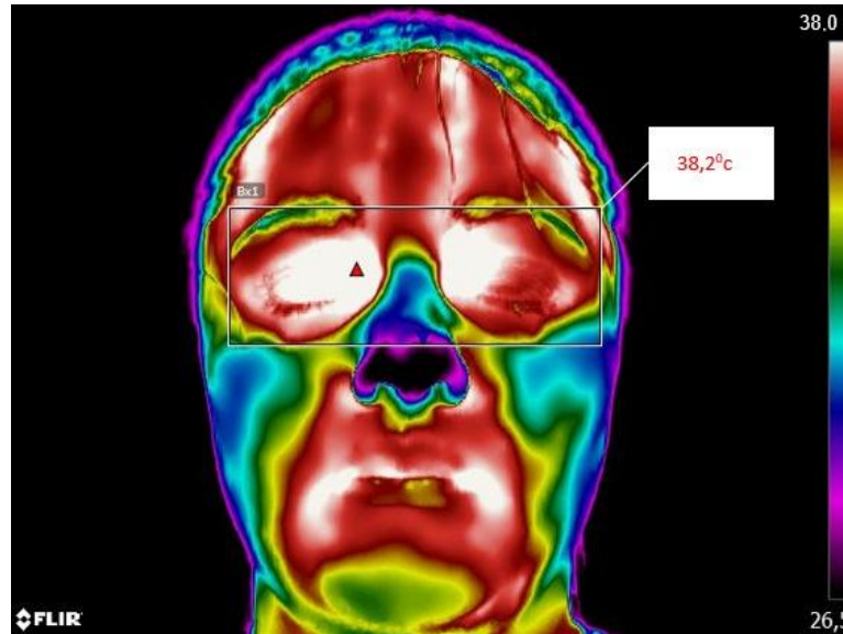
Figure 1. Infrared thermography image of a patient with fever.

All objects or bodies with temperature above absolute zero emit electromagnetic radiation, which is known as infrared radiation or thermal radiation (Jones, 1998). The infrared energy emitted from an object or person is directly proportional to its temperature. Infrared cameras create an image by converting radiant heat energy into a signal that can be displayed on a monitor. Therefore, temperatures are accurately measured by the infrared camera, where pixels are the data acquisition points for thermal temperature.