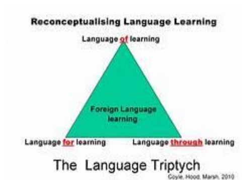
Figure 1 - CLIL model, in https://clickandclil.wordpress.com/2015/12/16/the-language-tryptich/

The image reproduced below summarizes the conceptualization presented by Coyle (2010) for learning a language, according to the CLIL approach.