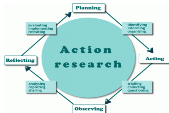
Figure 3 - Cycles of an action research, in https://rachelyoung.myblog.arts.ac.uk/files/2019/02/actionresearchimage.gif

The scheme presented in Figure 3 presents the cycle of an action-research, in a sequence of conceptualization and planning, intervention, registration and systematization of the intervention, analysis and evaluation of the results obtained, projecting in successive cycles of reconceptualization, planning, action and evaluation.