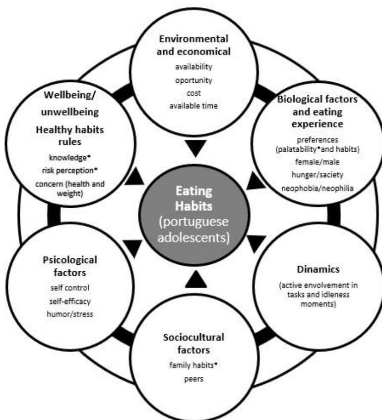
Figure 1 - Determinants identified by adolescents. Interactions network. Eating habits of adolescents are dependent on biological factors and eating experience, economic and environmental factors, psychological and sociocultural factors, sense of wellbeing, and health literacy (* referred to more often).

We present a diagram about the influence of several determinants identified on the adolescent eating behavior (fig 1).