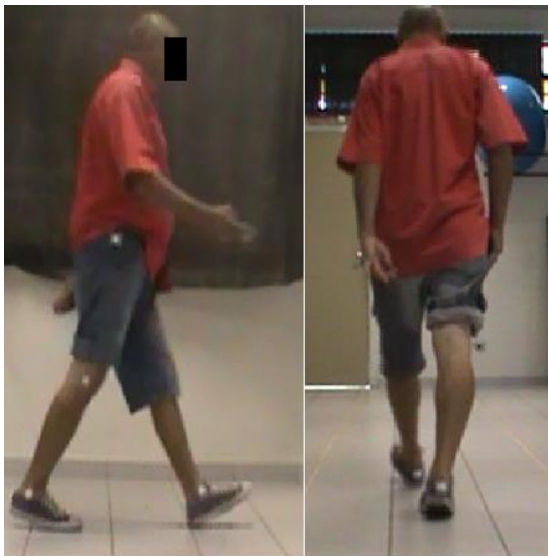
Figure 2. Photoreflexive markers on the anatomical points in the right side: trochanter, joint line of the knee, lateral malleolus and calcaneus; In the left side: medial malleolus and calcaneus, used for analysis of the length and step width.

for the analysis of the posterior view, that is, the SW, and another in the sagittal plane used for the analysis of the lateral view, that is, the SL, as shown in the figure 2 and an oval circuit (4.8 m x 3.2 m) that enables continuous gait and photo-reflective markers for the identification of the trochanter, line lateral side of the knee joint, lateral malleolus, and calcaneus on the right side of the body, and the medial malleolus and calcaneus on the left side of the body.