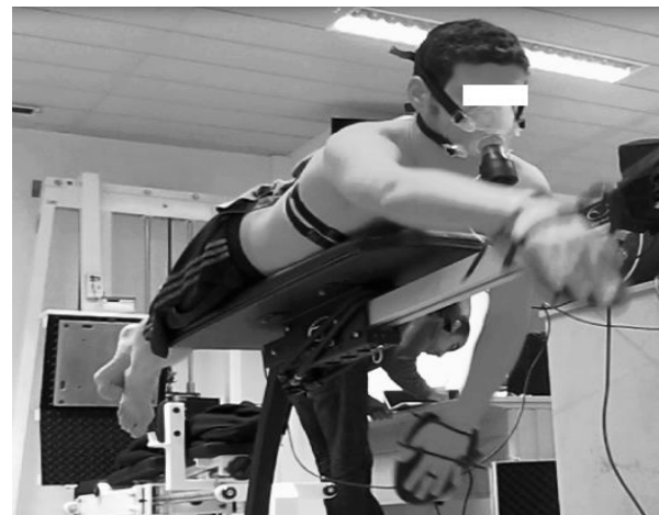
Figure 1. Example of the experimental setup

Twelve male surfers volunteered to participate in the study and were assigned to two groups, one comprising 6 elite competitive international level athletes (ES: mean age 25 \pm 8.4 years; body mass 68.5 \pm 3.8 kg; height 1.74 \pm 0.05 m) and the other composed by 6 recreational surfers (RS: mean age 32.3 \pm 3.1 years; body mass 73.2 \pm 7.8 kg; height 1.75 \pm 0.05 m) (Table 1). The ES were considered for this group if they had competed both in the national championship and at least in one or more events of the World Qualifying Series (WQS) in the previous year and trained at least 7 sessions a week. The RS were considered for this group if they had been surfing for at least 5 years and at least 2 sessions a week, but had never participated in any surfing competition. Informed consent was obtained from all participants as well as their parent or guardian if they were under 18 years of age.