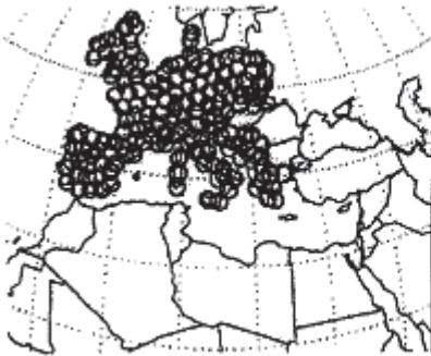
Fig. 1 Coverage of Europe against North African missile threat (Libyan attack) using 100 autonomous batteries.

Fig. 1 and Fig. 2 show the results of a simulation study performed in the United States on how to accomplish population coverage in Europe against ballistic missiles threat. The simulation shows that Europe may need 100 anti-missile batteries to face only two Libyan missile batteries, [Ref. 4]. The NATO allies in south Europe with the exception of Turkey were previously uncomfortable with NATO and US counter-proliferation strategies, preferring political approaches rather than building counter systems. The change of Europe’s attitude regarding this issue would produce a clear split in the Euro-Mediterranean security domain.