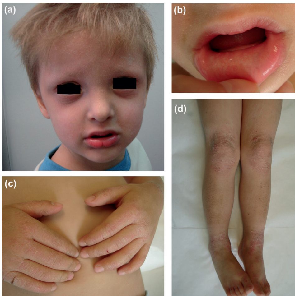
Figure 1 - Clinical pictures (a) Sparse, thin and brittle blonde hair, periorbital wrinkling with hyperpigmentation. (b) Anodontia. (c, d) Generalized severe eczema

The cardinal clinical features of XLHED comprise deficient sweating, partial or complete absence of dentition and sparse hair. Other physical findings include saddle-shaped nose or depressed nasal bridge, thick and protruding lips, sparse or absent eyebrows, dry skin with eczematous changes and periorbital pigmentation. 3