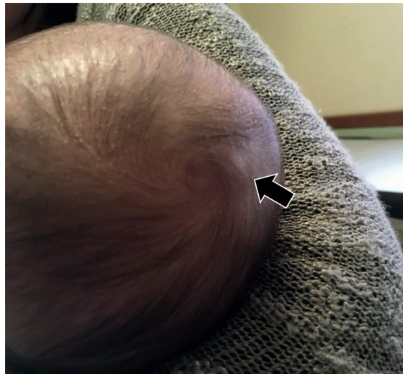
Figure 1 – Visible head lump on the right parietal region.