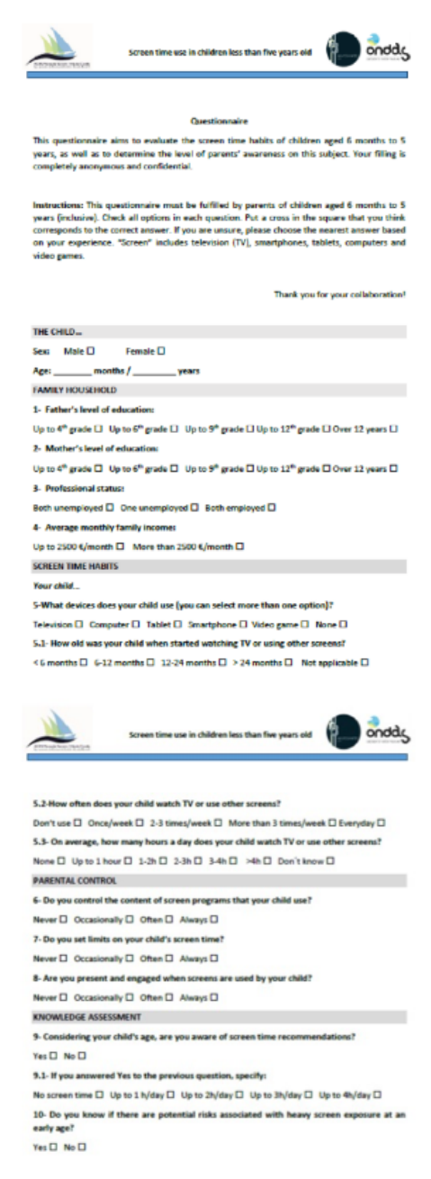
Figure I - Questionnaire (english version)

For the descriptive analysis of the data, the categorical variables were presented in frequencies and percentages and the continuous variables in mean and standard deviation. For the analytical study, chi-square and Student's t-tests were used at a significance level of 0.05. Data were analyzed using Statistical Package for the Social Sciences (SPSS) software, version 22.0 (IBM, Inc).