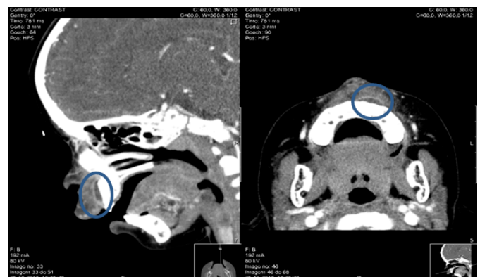
Figure 3 - CT images showing the lesion marked with a blue circle