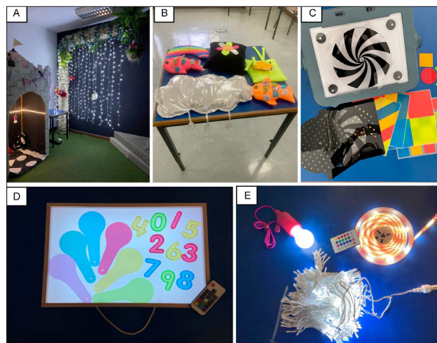
Figure 1. Visual stimulation room (A) and objects used in visual stimulation sessions: materials with bright colours and glowing under ultraviolet light (B), high contrast materials (C, D) and lighting material (E).

The goal of the sessions was a stepwise stimulation towards progressively more complex stimuli. All the sessions were conducted in newly designed visual stimulation room, equipped with different materials of increasing visual complexity, including: glowing materials under ultraviolet light, lights and lighting material (such as a projector wheel), material with bright colours, high-contrast materials and everyday life materials (Fig. 1).