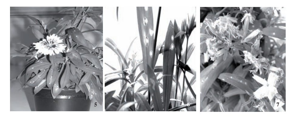
Figures 5, 6 and 7 – Pathogenicity tests on Dianthus chinensis. 'Eyespot' lesions on leaves, stems and flowers of plants inoculated with isolates of Burkholderia andropogonis from infected carnations. Fig. 5: First symptoms after inoculation. Fig. 6: Detail of leaves with lesions bordered by water-soaked halos. Fig 7: Infected flowers, some of them already dried out.

PCR amplification using primer pair Pf/Pr produced the expected 410-bp amplicon with genomic DNA templates from isolates 3 and 4 obtained from the inoculated D. chinensis plants (Fig. 4, lanes 6, 7, 8 and 9).