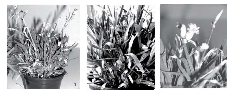
Figures 1, 2 and 3 – Plants of Dianthus caryophyllus showing 'eyespot' lesions on all aerial plant parts frequently bordered by water-soaked halos on the leaves. Older lesions became dark brown and affected areas dried out.

All potted plants were kept outdoors, close to each other and overhead-watered by sprinklers. No weeds were found in the premises as the ground over which the pots were laid down was covered with black polyethylene. No other plant species with symptoms of a bacterial disease were observed in the vicinity of the carnations plot or in other plants neighbouring the nursery.