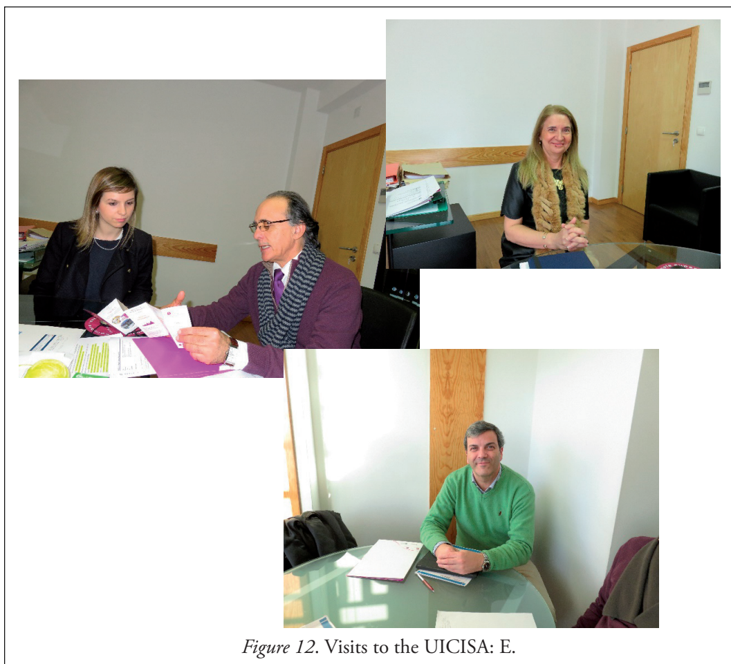
Figure 12. Visits to the UICISA: E.

Visitor's main activity: 1 master's student / 11 professors / 4 department coordinators / 1 accountant / 2 trainers / 2 health public service worker / 1 sub-coordinator / 1 PhD student / 25 directors.