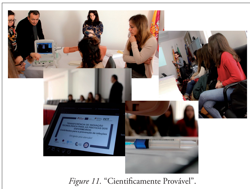
Figure 11. “Cientificamente Provável”.

This activity aims to contribute to the enrichment of pre-university students’ training, bringing primary and secondary schools closer to higher education institutions and involving young people in citizen science dynamics and collaborative learning practices.