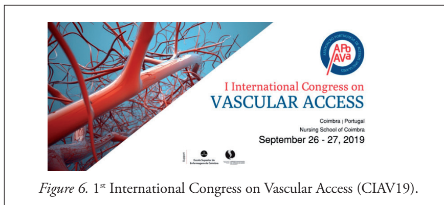
Figure 6. 1 st International Congress on Vascular Access (CIAV19).