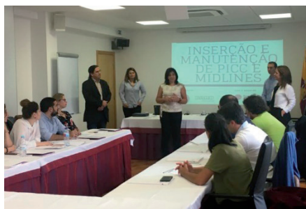
Figure 5. PICCs and Midlines Insertion and Maintenance Course.