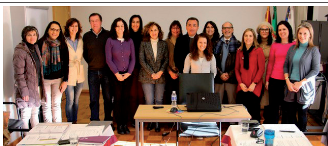
Figure 4. 8 th CSRTP.

The participants came from Portuguese and Brazilian educational and health institutions.