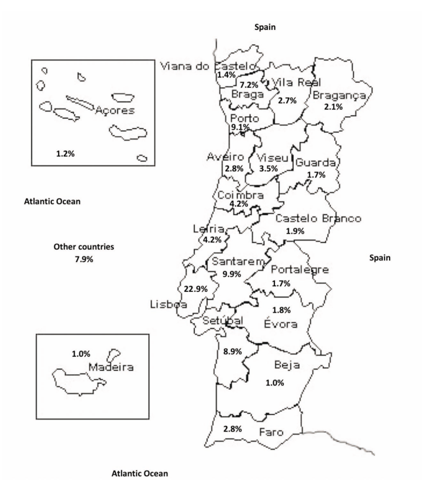
Figure 1 Cadets' district of birth (%) — 2016