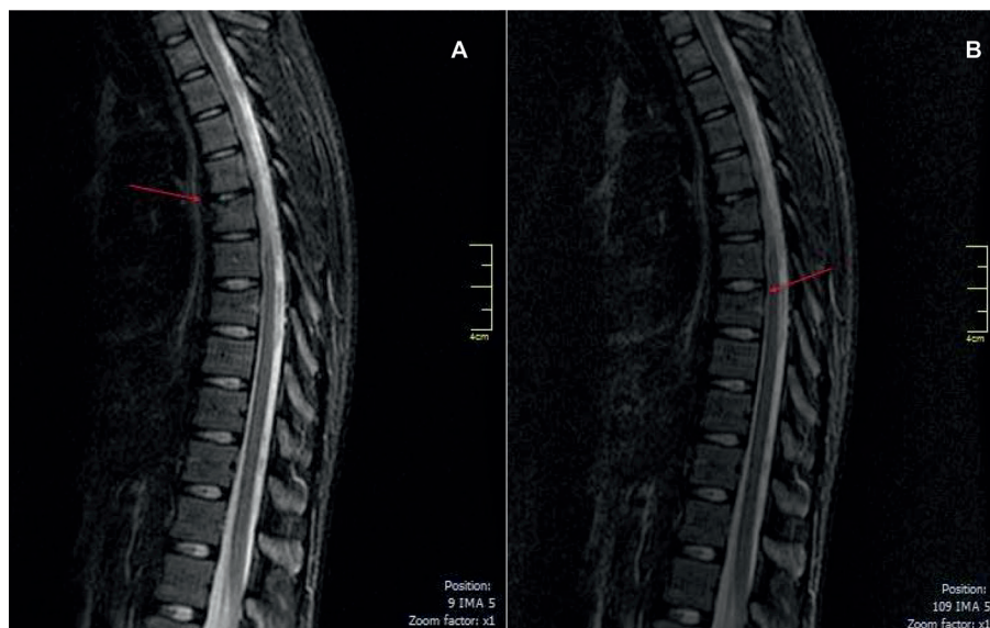
Figure 1 - D6 (A) and D8 (B) upper platform fractures.

Because of the appearance of movements previous described, with progressive worsening she was admitted to the emergency pediatrics department of a level 2 hospital. On her physical examination she was conscious and presented no focal neurologic deficit, including sensitivity asymmetries. It was evident rapid involuntary abdominal wall movements observed either in orthostatic and supine position (about 200 abdominal movements per minute, unrelated to respiratory cycles). When lying down there was observed involuntary, repetitive and rhythmic movements of her left leg. No other abnormal movements were detected. Physical and neurological exam were otherwise normal. The episodes were video recorded. The workup, including cells blood count, electrolytes and blood gases had no abnormalities. Vertebral magnetic resonance imaging (MRI) showed C3 and C4 signs of nerve root injury, D6 and D8 upper platform fractures, L4-L5 median and right paramedian herniated disc and L5-S1 grade I listhesis (images 1 and 2). In spite of being specifically asked it wasn't possible to visualize