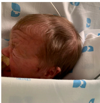
Figure 1 - Left parietal skull depression with approximately 3x3 cm of size and 2 cm of depth