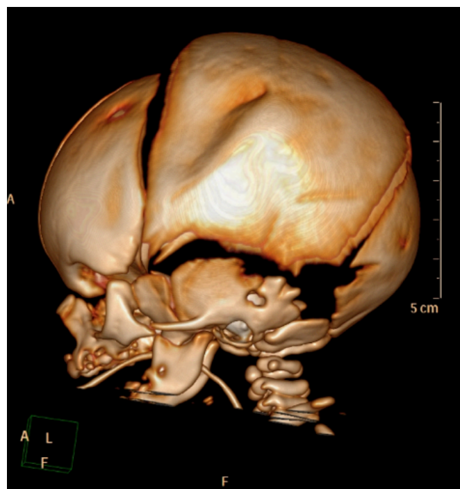
Figure 3 - Three-dimensional CT reconstruction showing invagination of the parietal bone (arrow)